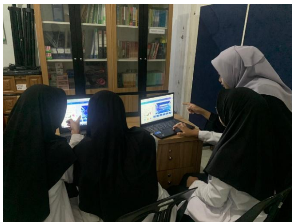
Figure 5. Teacher Assistance in Digital Collaborative Learning

The figure shows students engaging in collaborative digital learning while being guided by teachers, reflecting a hybrid model where openness and authority coexist through pedagogical control and collaborative exploration.