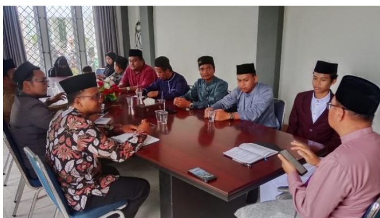
Figure 3. Collaborative Discussion Forum of Teachers as Knowledge Brokers.

The table shows that teachers play multiple strategic roles, including knowledge connectors, discussion facilitators, information mediators, network developers, collaborative learning designers, and motivators. These roles collectively indicate that teachers are central actors in managing knowledge flow and fostering adaptive, interactive, and relevant learning environments.