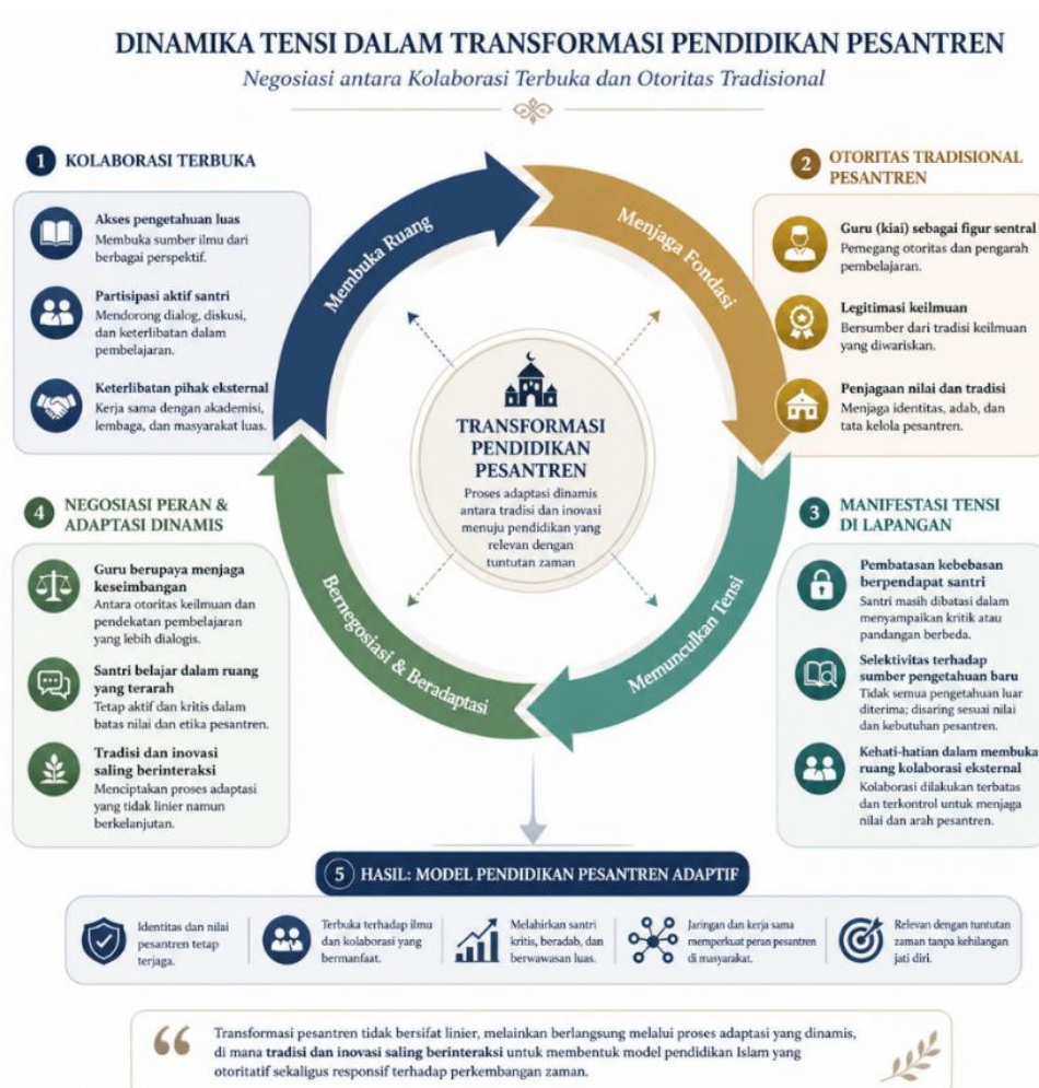
Figure 4. Visual Diagram of Tension Dynamics in Pesantren Transformation

This situation creates ongoing negotiation, such as limitations on students’ freedom of expression, selective acceptance of new knowledge, and cautious engagement with external collaborations. Some teachers strive to balance maintaining authority with adopting dialogical approaches. This indicates that pesantren transformation is non-linear and involves continuous adaptation between tradition and innovation.